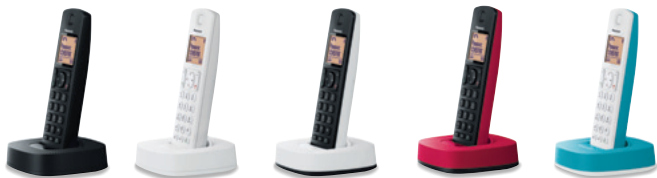
Black(B) White(W) Black & White(2) Black & Red(R) White & Blue(C)