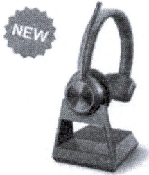
POLY SAVI 7300 OFFICE SERIES