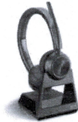
POLY SAVI 7200